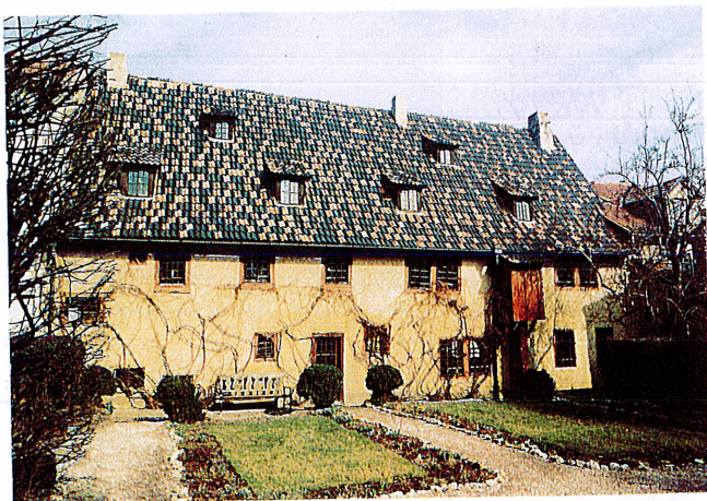
ABOVE: The house where Bach is believed to have been born in the Rittergasse in Eisenach, Thuringia, now a Bach museum.